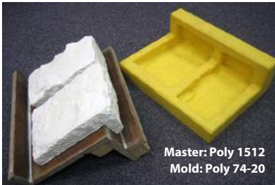
Master: Poly 1512 Mold: Poly 74-20